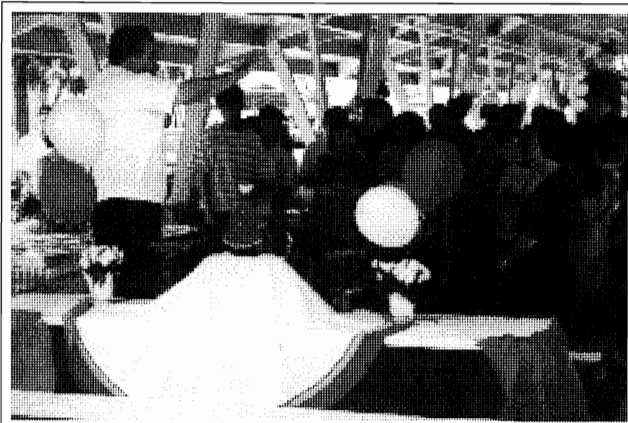
➤ The Blessing...