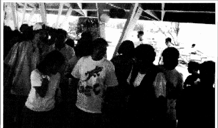
➤ Who's out of line? Not me!