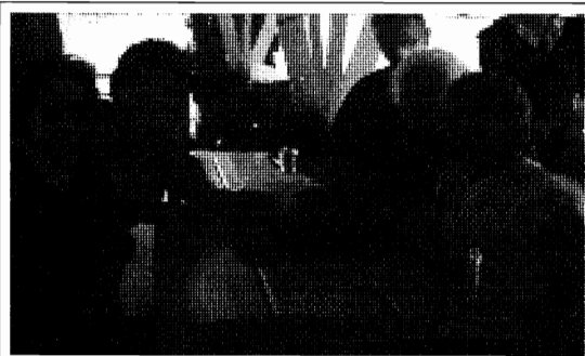
➤ The once young and the young ones ➤