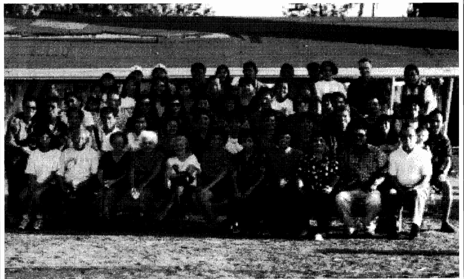
Bobonanons during the 5th annual fiesta celebration in San Diego, California