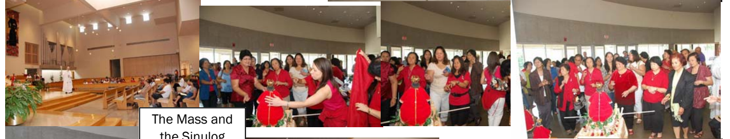
The Mass and the Sinulog

NOTE: To view more pictures, log on to www.bobon.us