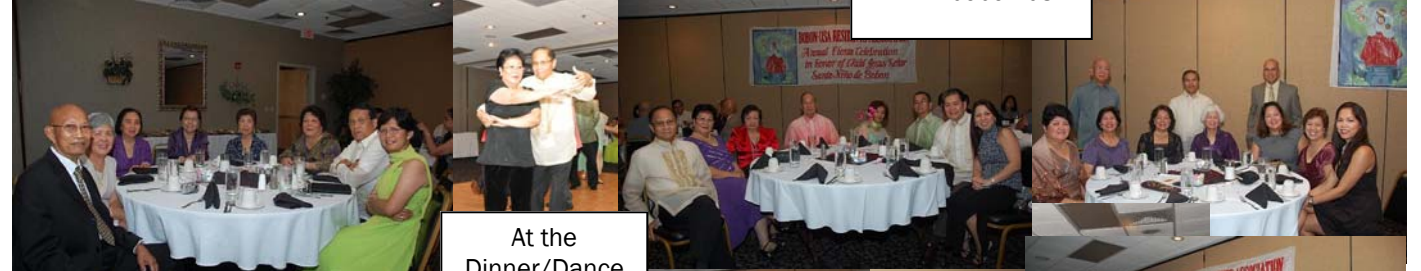
At the Dinner/Dance

NOTE: To view more pictures, log on to www.bobon.us