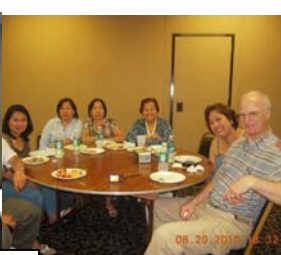
Vespera Dinner at the Shrine