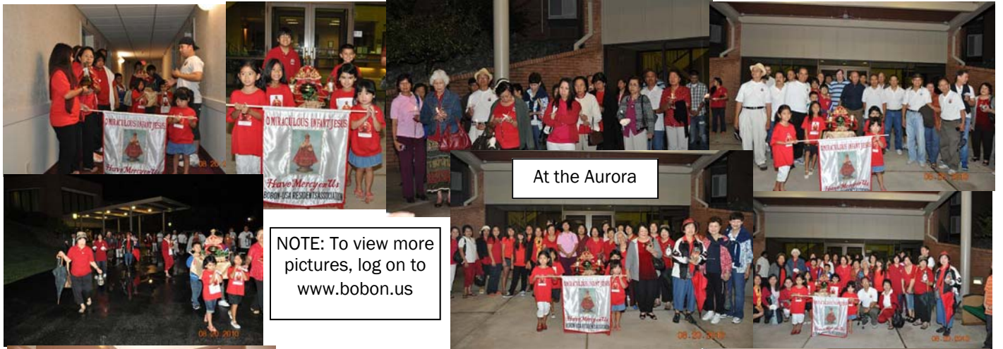
At the Aurora

NOTE: To view more pictures, log on to www.bobon.us