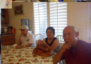
9-Day novena sponsors in Arizona and at the Shrine.